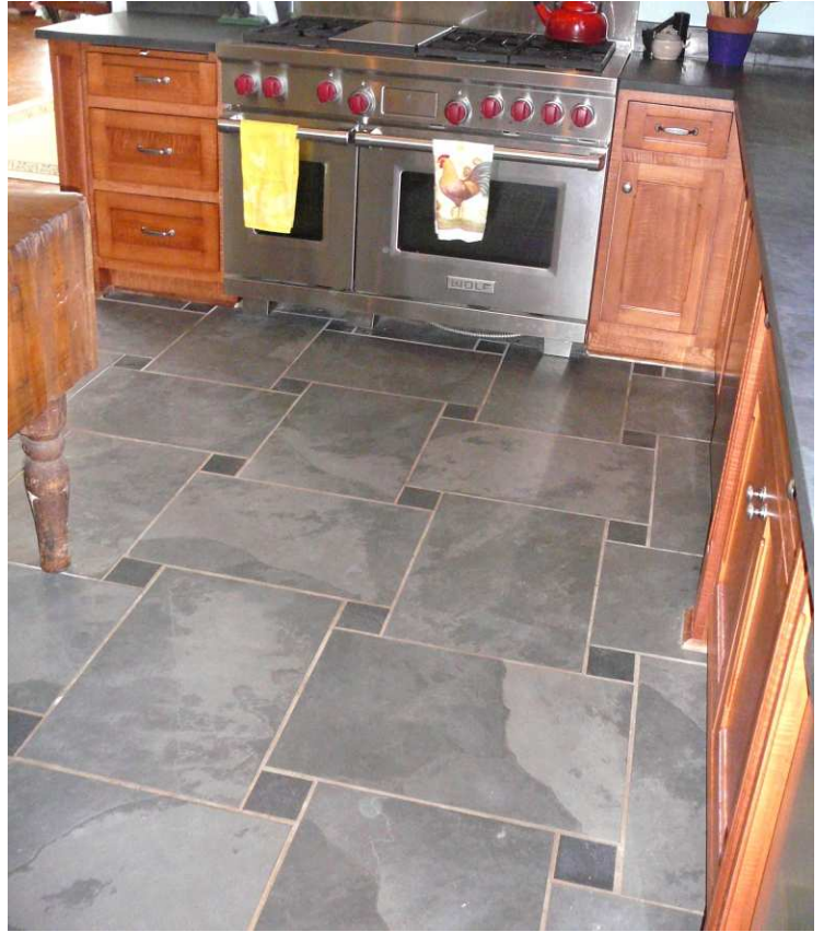
Historic Gray with black accents.

Care should be taken to make sure the stone is fully supported with installation. Sealers may also be applied to enhance the color of the stone, protect the slate from staining penetrants, and to protect the grout from deterioration.